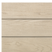
Limed Oak MDE176L