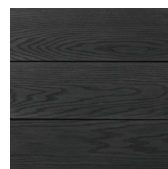
Burnt Cedar MDE176R