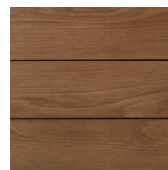
Coppered Oak MDE176C