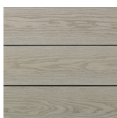
Smoked Oak MDE176D