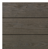
Ebony Grey MDE176Y