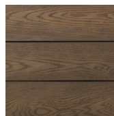
Antique Oak MDE176A