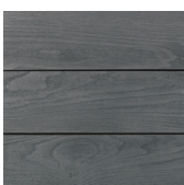
Brushed Basalt MDE176B