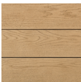
Golden Oak MDE176G